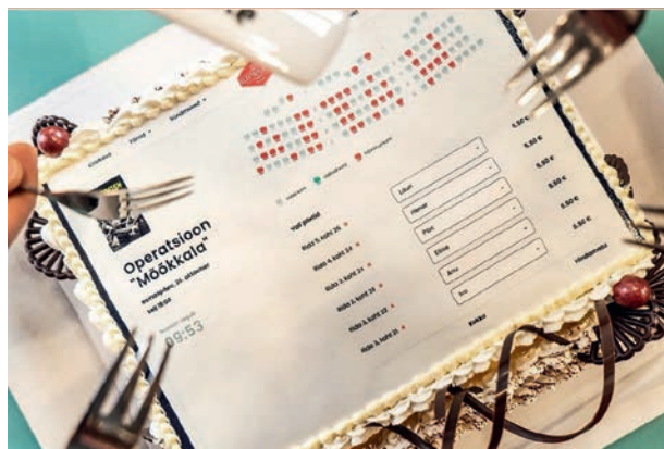
Project partners in development team enjoying the cake to celebrate the milestone when booking with reserved seats was completed.

Partner cinemas contribute greatly in providing their input on what their biggest needs are and what tasks they would hope to automate. Their main input is in constant testing and feedback on what is working and what should be changed to make things better. We, in Elektriteater, together with programmers, are undertaking the technical work. But a lot of the thinking, finding the best solutions and, most importantly, in identifying problems to solve, is done together with all four partner cinemas.